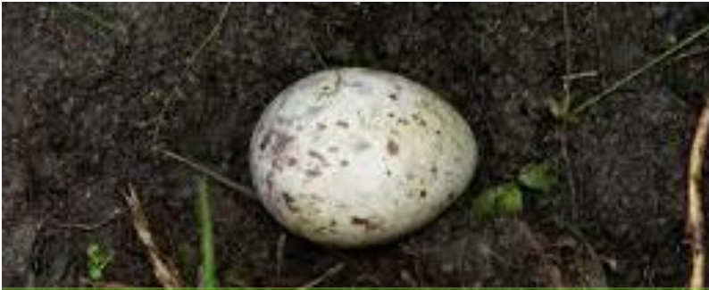
A corncrake's egg weighs barely a third of a hen's egg.