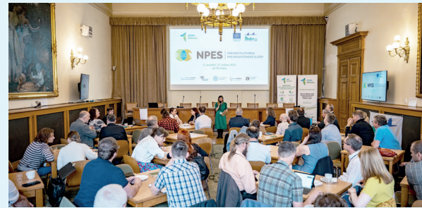
The fourth NPES meeting, 27 May 2025, CAS Prague, photo: Michal Gálik.